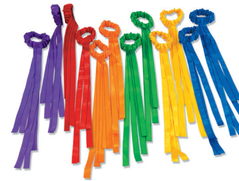
DD127 • Lakeshore Wrist Ribbons - Set of 12