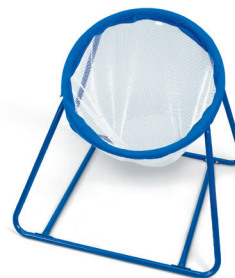
HH281 • Early Years Ball Toss WSP75019 • Mini Basketball