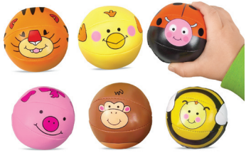
PP256 • Little Hands Animal Balls