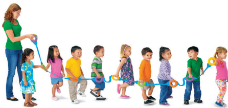
RR748 • Hold-A-Ring Walking Rope