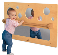
AA279 • Look at Me! Balance Bar (40" w x 24" h)