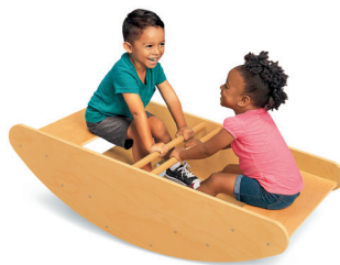
LC353 • Wooden Boat Rocker (46" w x 23 1/2" d x 11" h)