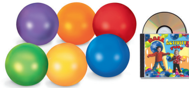
RA298 • 6" Activity Balls CD835 • Ball Fun Activity CD