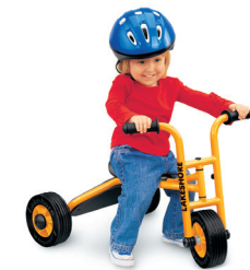
LA158 • Lakeshore Scooter Trike