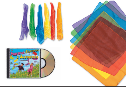
TT681 • Activity Scarves WSP69167CD • Musical Scarves Activity CD