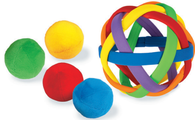
LL759 • Hide & Seek Discovery Ball