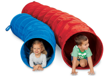
LA245 • Heavy-Duty Play Tunnel (6'1 x 19" w) LA244 • Heavy-Duty Giant Play Tunnel (9'1 x 22" w)