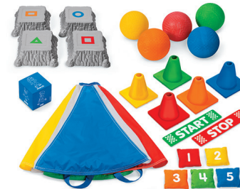
AA450 • Toddler-Safe Active Play Kit