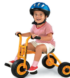
LA153 • Lakeshore First Trike CS416 • Extra-Small Safety Helmet