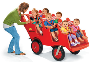
BG261 • Bye-Bye® Buggy for 6 (75 1/2" l x 29 1/2" w x 41 1/2" h) BG262 • Cover BG263 • Sun Canopy - Set of 3