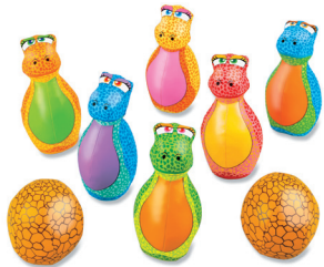
BB592 • Baby Bowling