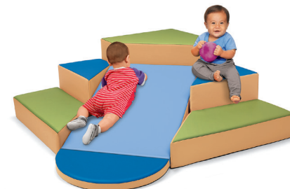
AA140 • Waterfall Climber (54" w x 67" d x 18" h)