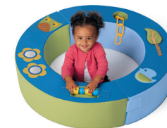
AA250 • Play & Explore Sensory Ring (36" w)