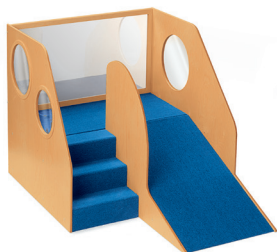
AA659 • Lakeshore Toddler Loft (42" w x 60" d x 38" h)