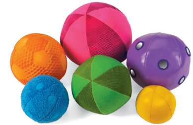
DD384 • Soft & Washable Sensory Balls