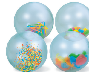
FF993 • See-Inside Activity Balls