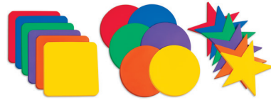
RA239 • Colours & Shapes Activity Mats