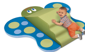
AA130 • Butterfly Climber (59" w x 52" d x 11 3/4" h)