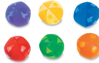
JJ152 • Soft & Safe Sensory Balls