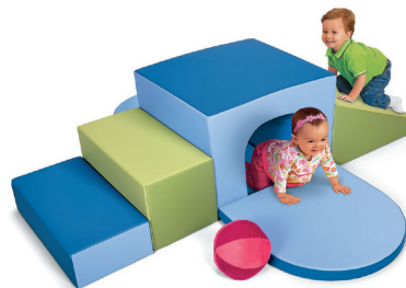
AA120 • Tot Tunnel Climber (72" w x 72" d x 20" h)