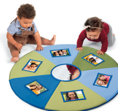
AA267 • See & Display Picture Mat (36" w)